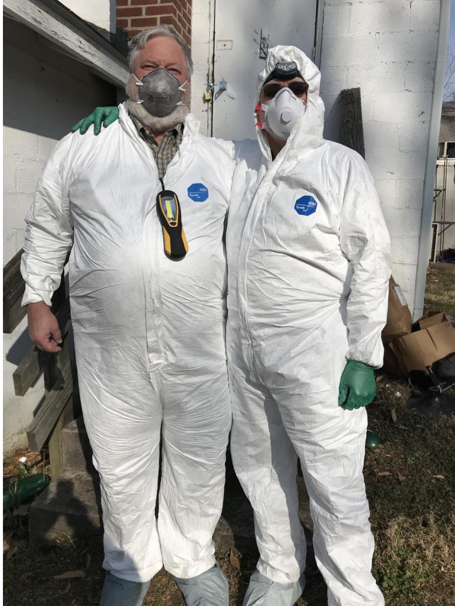
Base CDR and Vice CDR at Post 162's Back door

“PLEASE KEEP THE FOLLOWING IN YOUR PRAYERS.